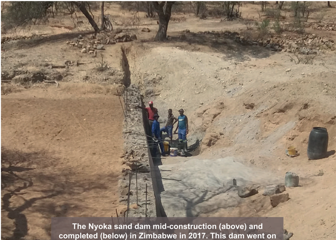
The Nyoka sand dam mid-construction (above) and completed (below) in Zimbabwe in 2017. This dam went on to support around 700 people from the Tshelanyemba and Bhebhe communities to access clean water.