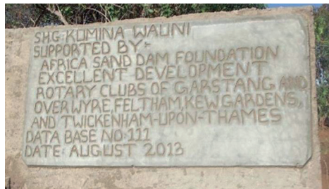
A dam plaque featuring Rotary supporters

Excellent have extensive experience having completed over 1,000 sand dams.