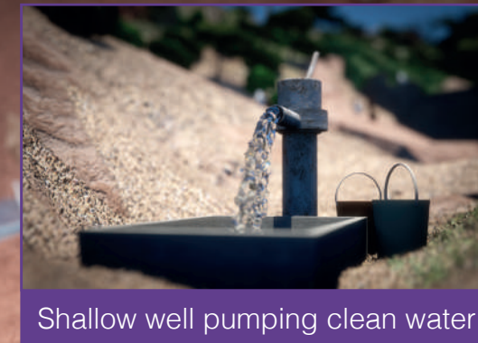
Shallow well pumping clean water

The volume of sand behind the dam holds up to 25 to 40% water. This protects the water from evaporation and filters it clean. Pipework built into the dam provides easy access from a tap or animal trough, and shallow wells pump water from the recharged aquifer. Up to 40 million litres of water... a new life on tap.