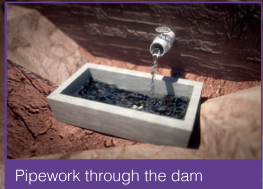
Pipework through the dam