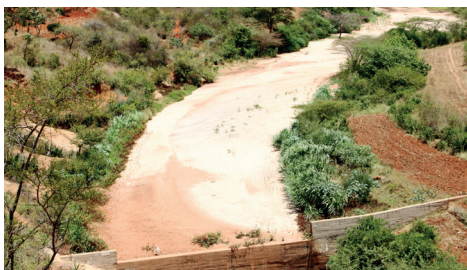
A sand dam chain in Kenya

Within one to four rainy seasons, the dam fills with sand. But, up to 40 million litres of water is stored in the pores between sand particles. Here it can be extracted and is protected from evaporation, contamination and disease transmitters, such as mosquitoes and freshwater snails.