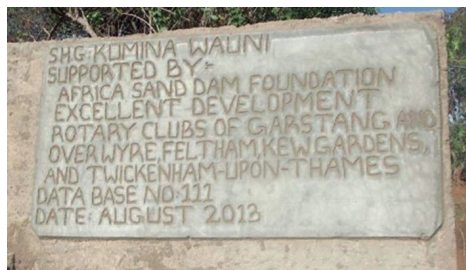
A dam plaque featuring Rotary supporters